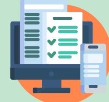
OPEN SOURCE INTELLIGENCE