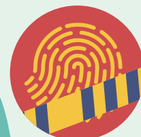
CRIME PREVENTION & FORENSICS