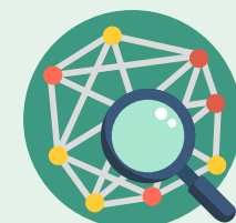
LINKS BETWEEN CRIME AREAS