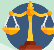
FUNDAMENTAL & HUMAN RIGHTS