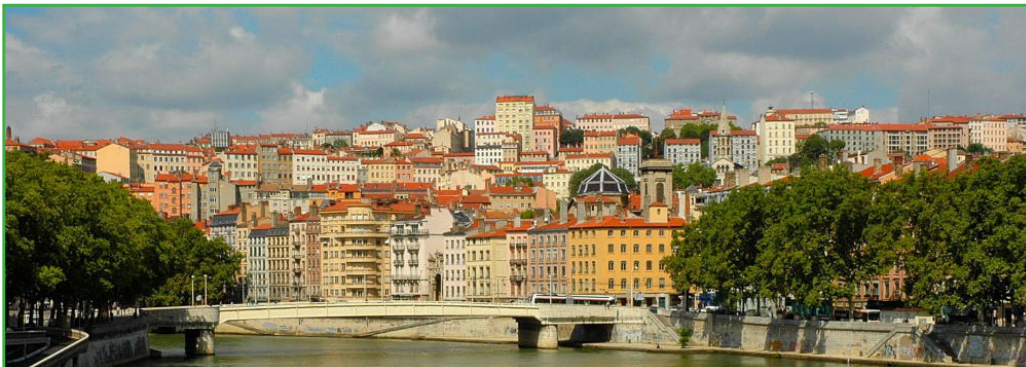
Basilica of Fourvière